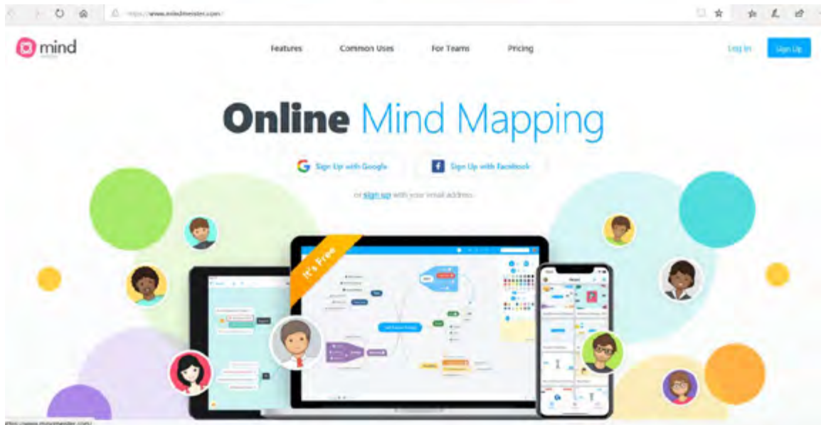
Fig 1 – mindmeister.com website